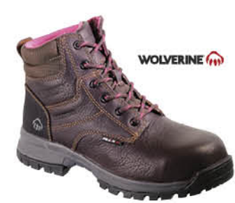
WW10180 (Women's) - $95.00

Available Sizes: D 7-12,13,14,15 EE 7-12,13,14,15 Safety Properties: ST, EH, SR, WP