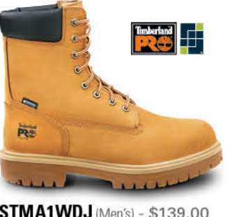
STMA1WDJ (Men's) - $139.00

Available Sizes: M 5-10,11; W 6-10 Safety Properties: CT, EH, SR, WP