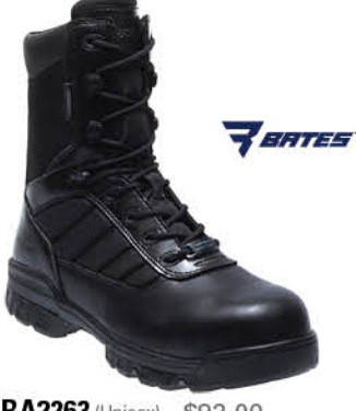
BA2263 (Unisex) - $92.00

Available Sizes: M 7-12,13,14,15; W 7-12,13,14,15 Safety Properties: ST, EH, SR, INS, WP