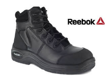
WGRB6765 (Unisex) - $121.00

Available Sizes: M 6-13 (no half sizes) Safety Properties: ST, PR, EH, INS, WP