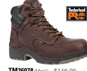
TM26078 (Men's) - $149.00

Available Sizes: M 5.5-10,11; W 6-10,11 Safety Properties: AT, EH, SR, CG