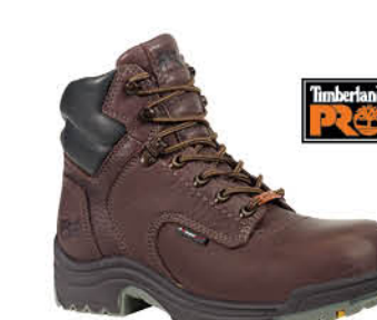
TM65016 (Men's) - $111.00

Safety Properties: CT, EH, SR, SF, SZ *Women-please use size conversion chart when ordering