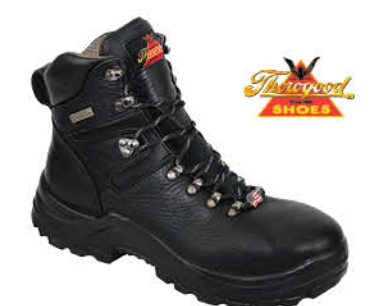
TG804-6266 (Men's) - $199.00

Available Sizes: M 7-12,13,14; EW 8-12,13 Safety Properties: CT, EH, SR, CG, WP