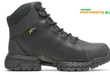
23130 (Unisex) $175.00 Available Sizes: D 4-12,13,14; EEE 7-12,13,14