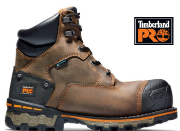
TM92615 (Men's) $185.00 Available Sizes: M 7-12,13,14,15; W 7-12,13,14,15