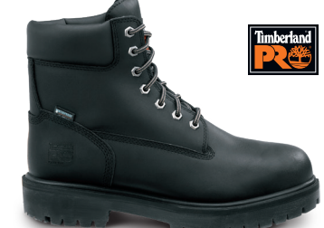
STMA1W52 (Men's) $112.50 Available Sizes: M 7-12,13,14,15; W 7-12,13,14,15