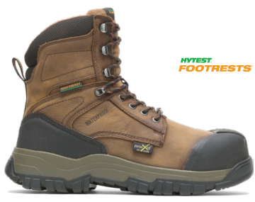
14562 (Men's) $185.00 Available Sizes: M 7-12,13,14,15; W 7-12,13,14,15