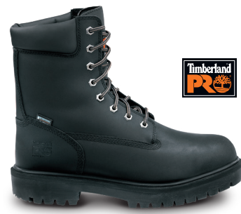
STMA1WDU (Men's) $135.00 Available Sizes: M 7-12,13,14,15; W 7-12,13,14,15