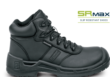
SRM9150 (Men's) $90.00 Available Sizes: M 7-12,13,14,15; EW 7-12,13,14,15