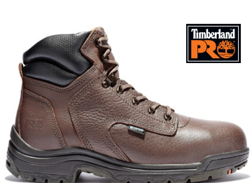
TM26078 (Men's) $155.00 Available Sizes: M 7-12,13,14,15; W 7-12,13,14,15