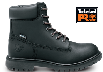
STMA1X83 (Women's) $125.00 Available Sizes: M 5.5-10,11