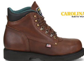
CA1309 (Men's) $199.00 Available Sizes: D 8-12,13,14; EE 8-12,13,14