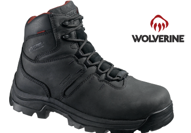
WW8399 (Men's) $101.00 Available Sizes: M 7.5-12,13,14; EW 7.5-12,13