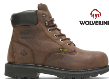
WW5679 (Men's) $130.00 Available Sizes: M 7-12,13,14; EW 7-12,13