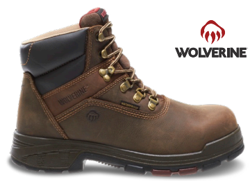
WW10314 (Men's) $145.00 Available Sizes: M 7-12,13,14; EW 8-12,13