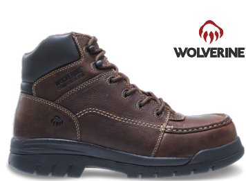
WW4626 (Men's) $89.00 Available Sizes: M 7-12,13,14; EW 7-12,13