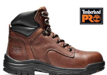
TM26388 (Women's) $109.00 Available Sizes: M 5.5-10,11; W 6-10,11