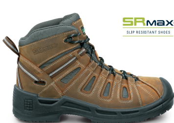
SRM9170 (Men's) $99.00 Available Sizes: M 7-12,13,14,15; EW 7-12,13,14,15