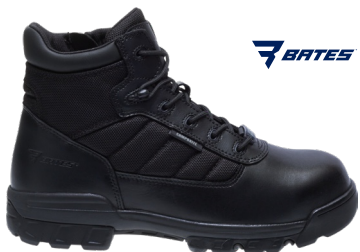
BA2264 (Unisex) $95.00 Available Sizes: M 4-12,13,14,15; EW 7-12,13,14