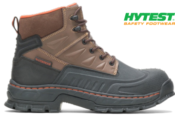
13571 (Men's) $125.00 Available Sizes: M 8-12,13,14; W 8-12,13,14