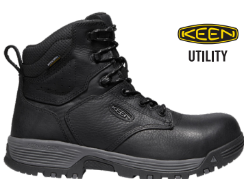
KN1024184 (Men's) $154.99 Available Sizes: D 7-12,13,14,15; EE 7-12,13,14,15