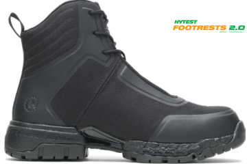
23190 (Men's) $155.00 Available Sizes: D 8-12,13,14; EEE 8-12,13,14