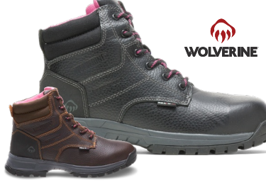
WW10181 BLACK (Women's) $99.00 WW10180 BROWN (Women's) $99.00 Available Sizes: M 5-10,11; W 6-10