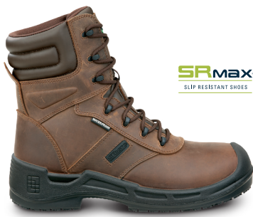
SRM9960 (Men's) $119.00 Available Sizes: M 7-12,13,14,15; EW 7-12,13,14,15