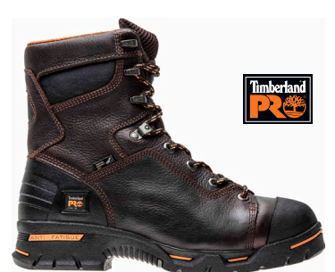
TM52561 (Men's) $151.00 Available Sizes: M 7-12,13,14; W 7-12,13,14,15