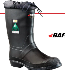
BAF8574 (Unisex) $99.00 Available Men's Sizes: MW 6-14 (no half sizes)

WINTER BOOT SELECTION If you also purchase these styles, you will be eligible for a separate $60 subsidy.