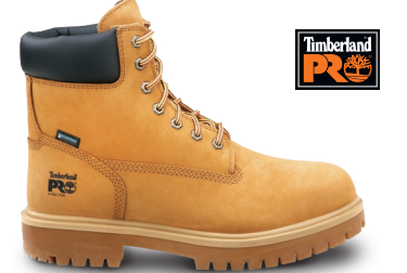
STMA1W6B (Men's) $112.50 Available Sizes: M 7-12,13,14,15; W 7-12,13,14,15