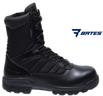
BA2263 (Unisex) $94.00 Available Sizes: M 5-12,13,14,15; EW 7-12,13,14