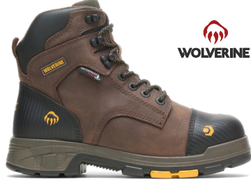
WW10706 (Men's) $165.00 Available Sizes: M 8-12,13,14; EW 8-12,13