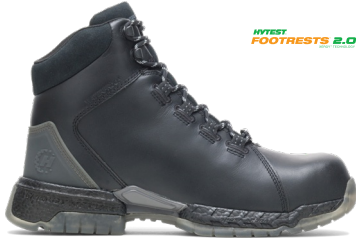
22470 (Unisex) $150.00 Available Sizes: D 4-12,13,14; EEE 7.5-12,13,14